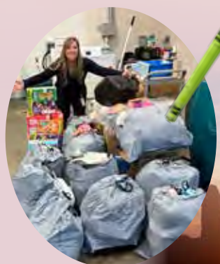
Pinecrest's counselor is thrilled with the first load of donations!