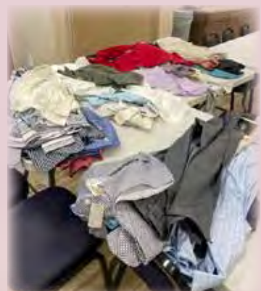
Pinecrest's Reward Center is fully restocked and ready to entice the kids to put forth great effort to overcome their situations.