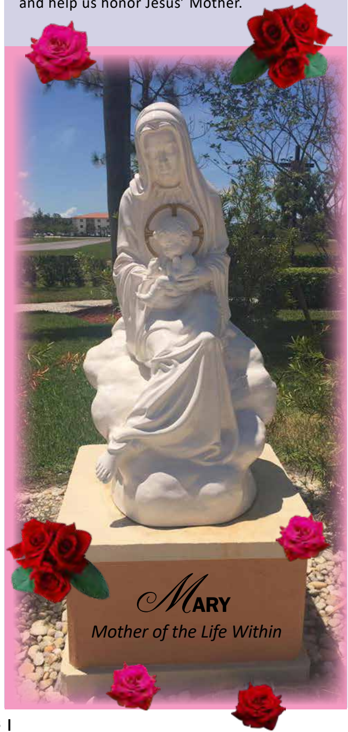
MARY Mother of the Life Within

All members of the parish are invited to join us for this celebration. Please bring your rosary and help us honor Jesus' Mother.